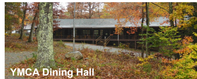
Lake Robert Rooke