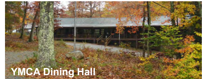
YMCA Dining Hall